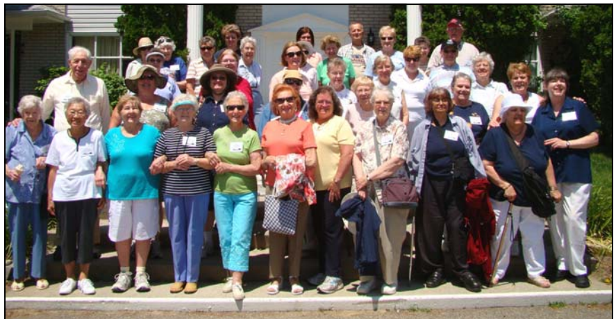
1000 Islands Senior Fun & Sun at the Colonial Resort & Spa, Gananoque 2009

For additional information or to become a member please contact our Vacation Plus Coordinator at 416-422-2030.